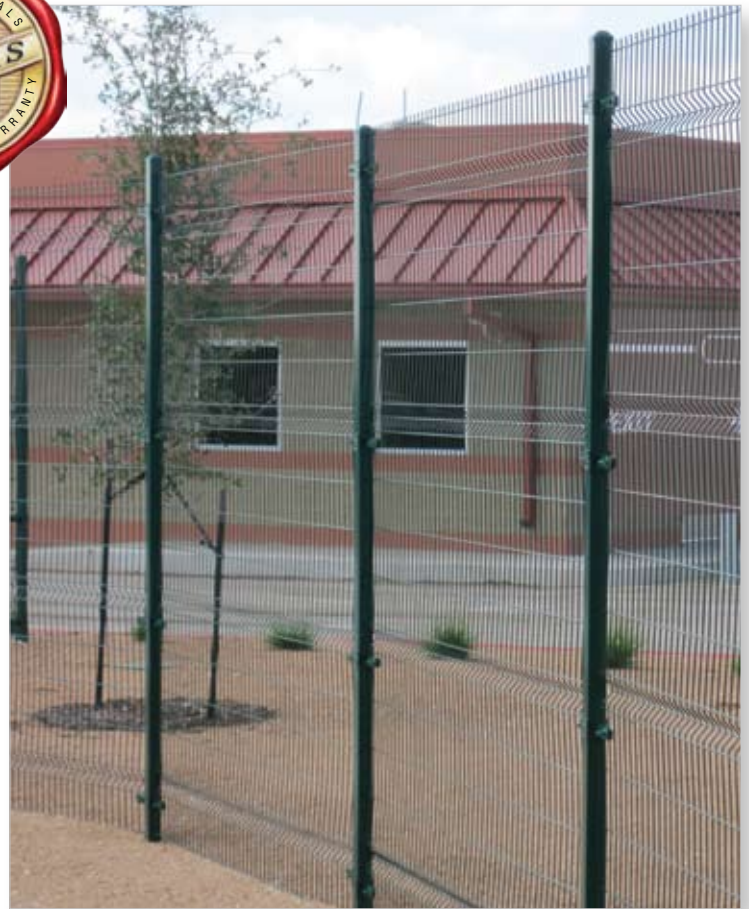
8 ft. Tuf-Grid® Welded Wire, Green