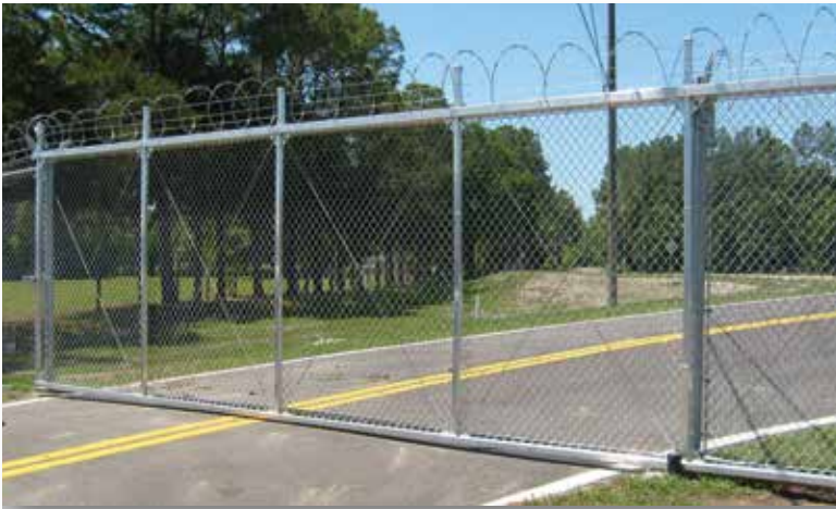
SECURE-TRAC® CANTILEVER SLIDE GATE WITH ALUMINIZED FABRIC AND ALUMINIZED BARBED WIRE