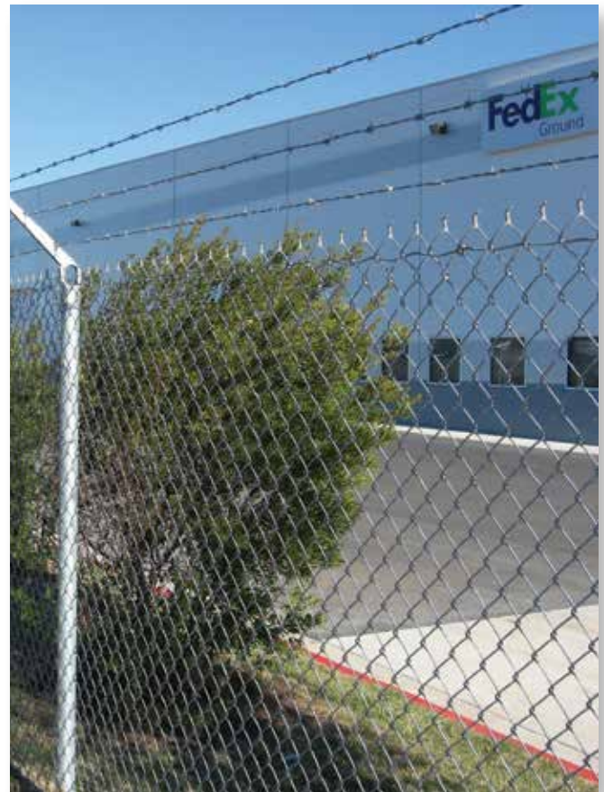
FEDEX FACILITY - AUSTIN, TX